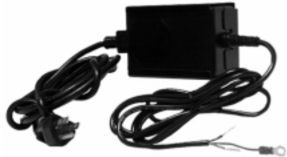
Figure 1. 2100-0300 Wall-Mount Power Supply